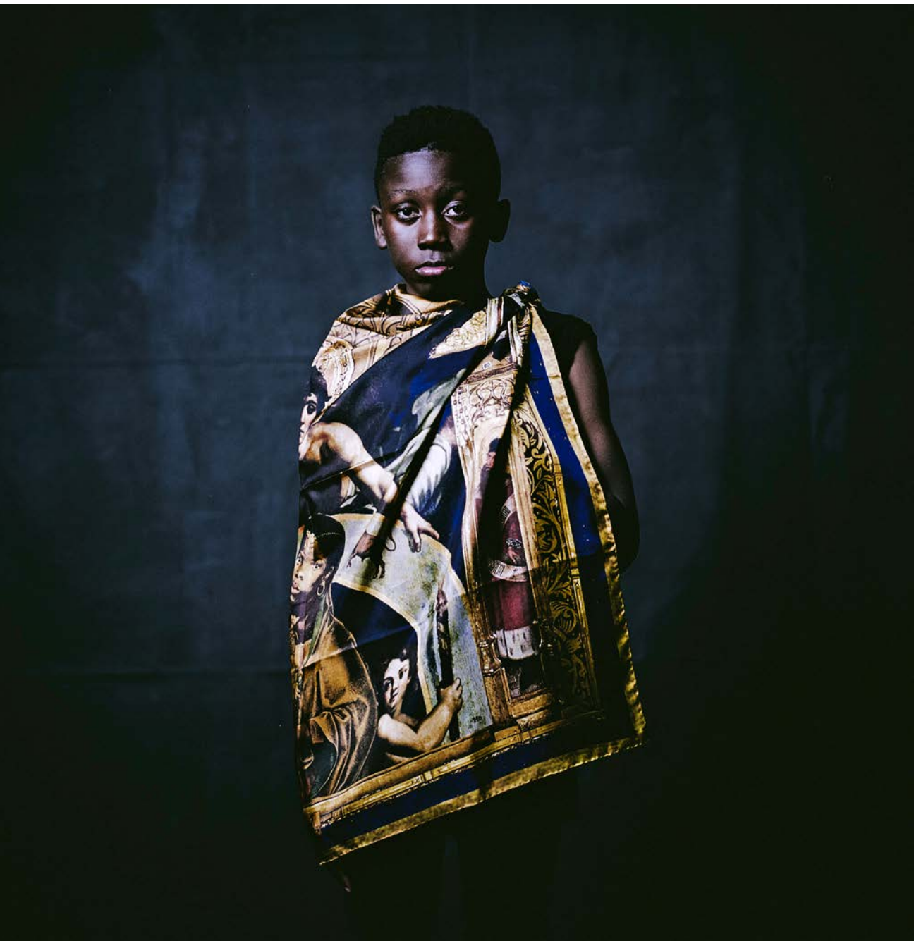
Ikiré Jones, Born Between Borders , 2017.